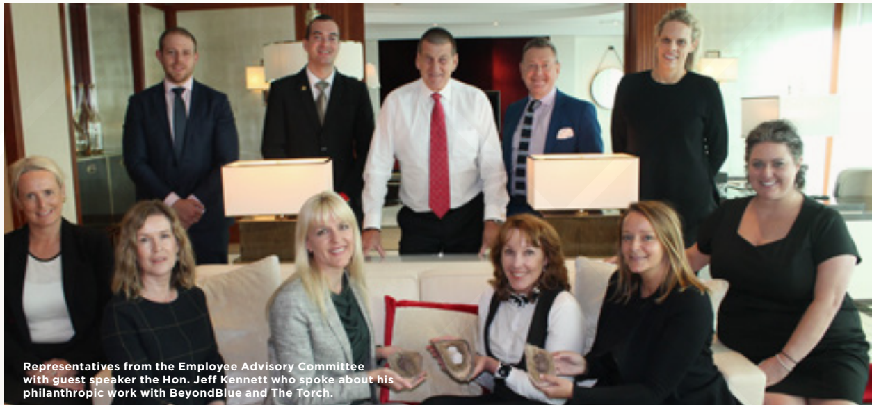
Representatives from the Employee Advisory Committee with guest speaker the Hon. Jeff Kennett who spoke about his philanthropic work with BeyondBlue and The Torch.

The goal of this program is to recognise and reward the work of our employees in the community. This year saw 18 grants allocated to organisations that were nominated by Crown Melbourne and Crown Perth employees. The recipient organisations ranged from local primary schools to domestic violence shelters and animal welfare organisations.