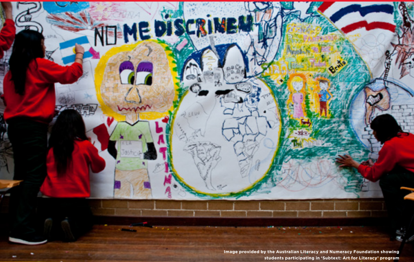
showing students participating in 'Subtext: Art for Literacy' program

The Western Sydney Arts Initiative is a $30 million, 10 year commitment (financial year 2015 – financial year 2024). It has been designed to support and promote the arts and education in Western Sydney. The programs selected for funding build on Western Sydney's dynamic creative culture, and will make art, in its many forms, more available to the youth of Western Sydney.