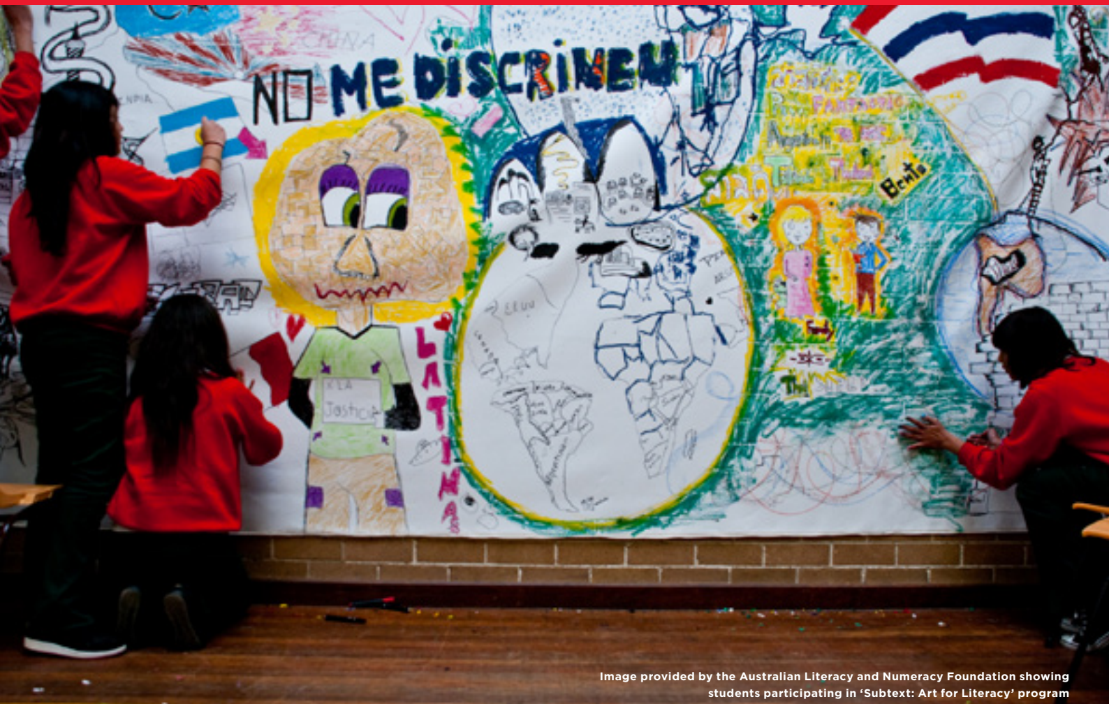
Image provided by the Australian Literacy and Numeracy Foundation showing students participating in 'Subtext: Art for Literacy' program

The Western Sydney Arts Initiative is a $30 million, 10 year commitment (financial year 2015 – financial year 2024). It has been designed to support and promote the arts and education in Western Sydney. The programs selected for funding build on Western Sydney's dynamic creative culture, and will make art, in its many forms, more available to the youth of Western Sydney.