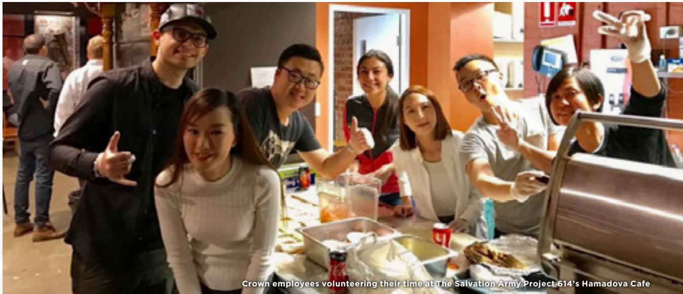
Crown employees volunteering their time at The Salvation Army Project 614's Hamadova Cafe

To learn more about The Salvation Army Project 614's work, visit their website: http://www.salvationarmy.org.au/en/Find-Us/Victoria/Melbourne614/