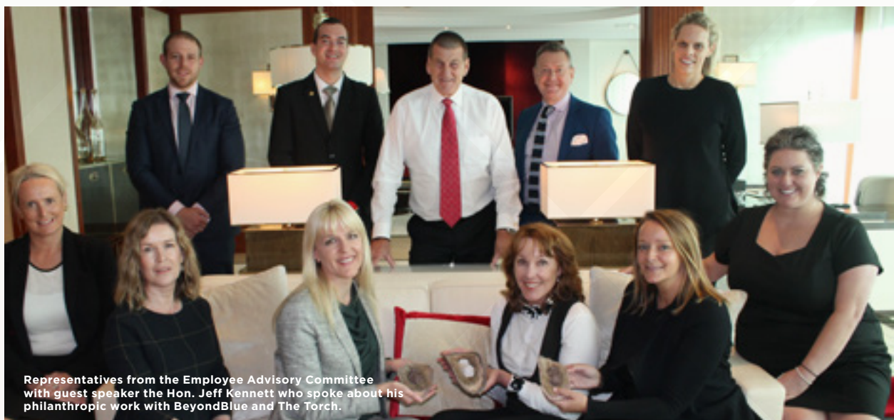
Representatives from the Employee Advisory Committee with guest speaker the Hon. Jeff Kennett who spoke about his philanthropic work with BeyondBlue and The Torch.

The goal of this program is to recognise and reward the work of our employees in the community. This year saw 18 grants allocated to organisations that were nominated by Crown Melbourne and Crown Perth employees. The recipient organisations ranged from local primary schools to domestic violence shelters and animal welfare organisations.