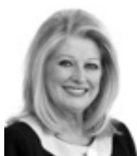
The Hon. Helen Coonan