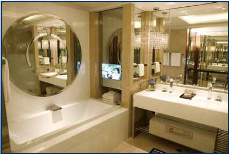
Crown Towers Refurbishment