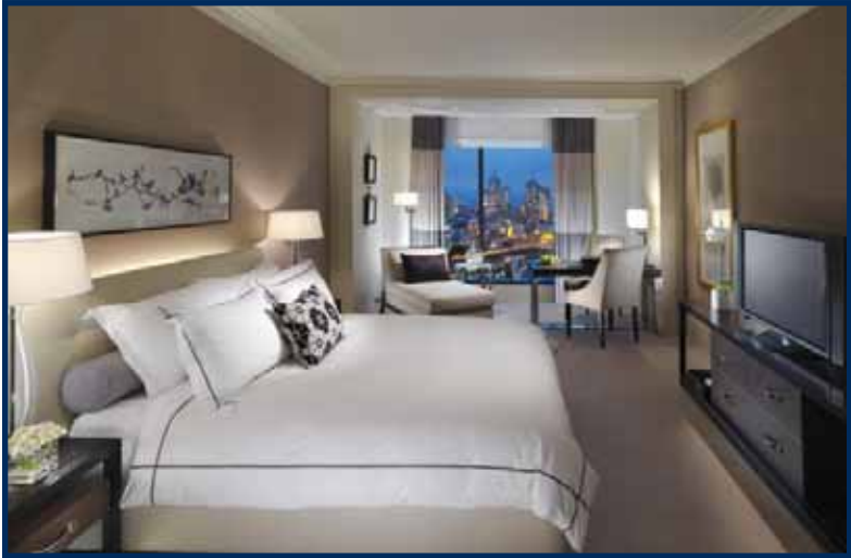
Crown Towers Refurbishment