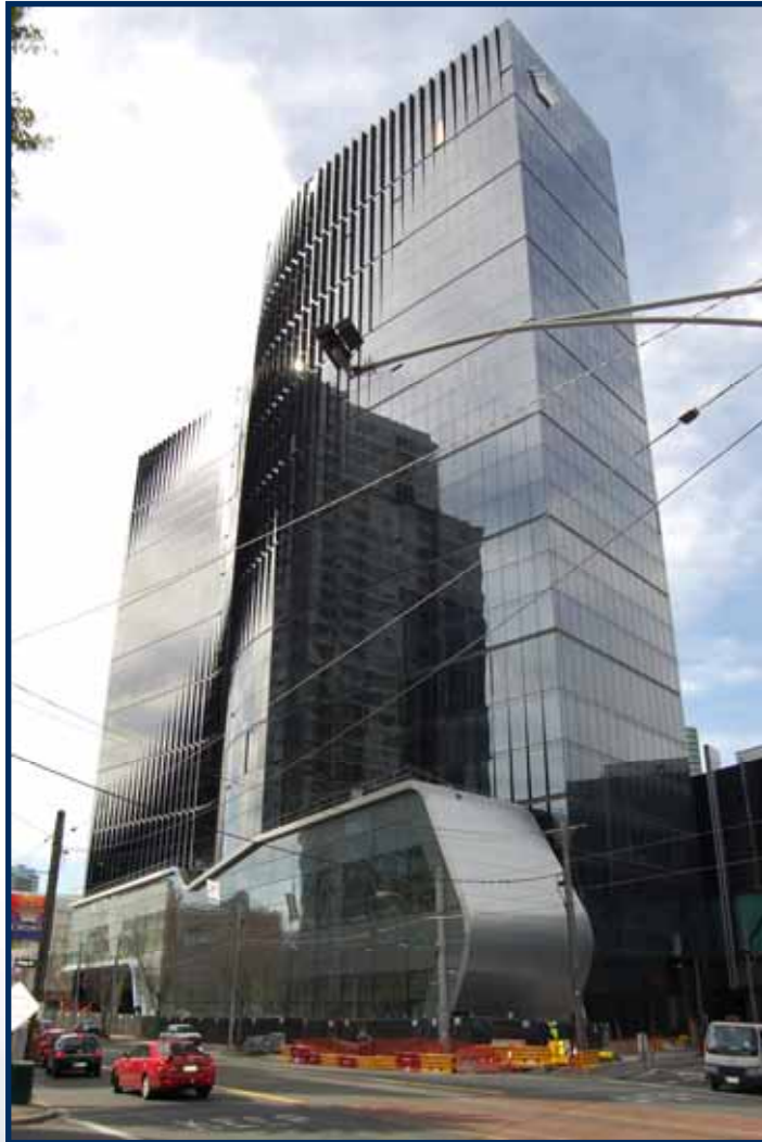
658 room Crown Metropol Hotel under construction