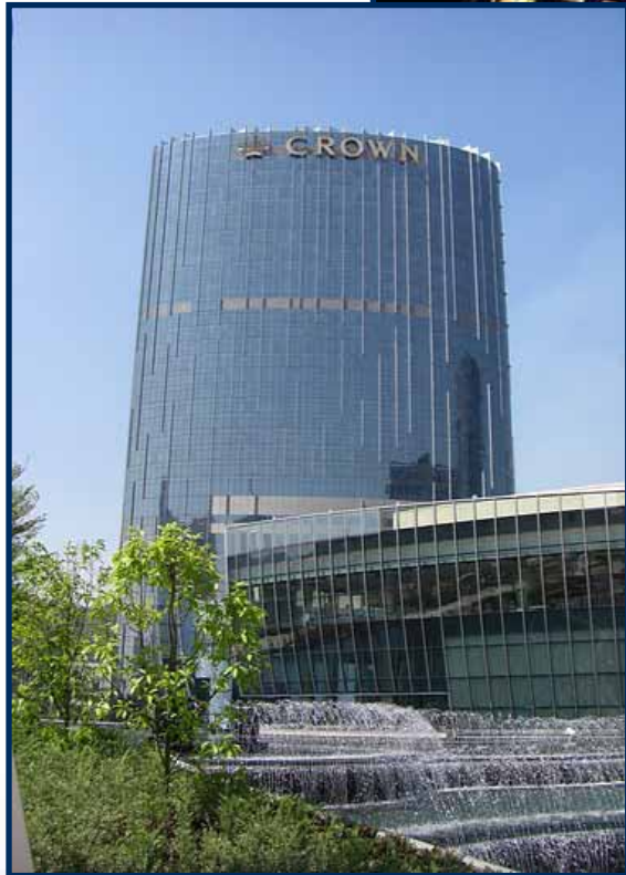
Crown Towers at City of Dreams