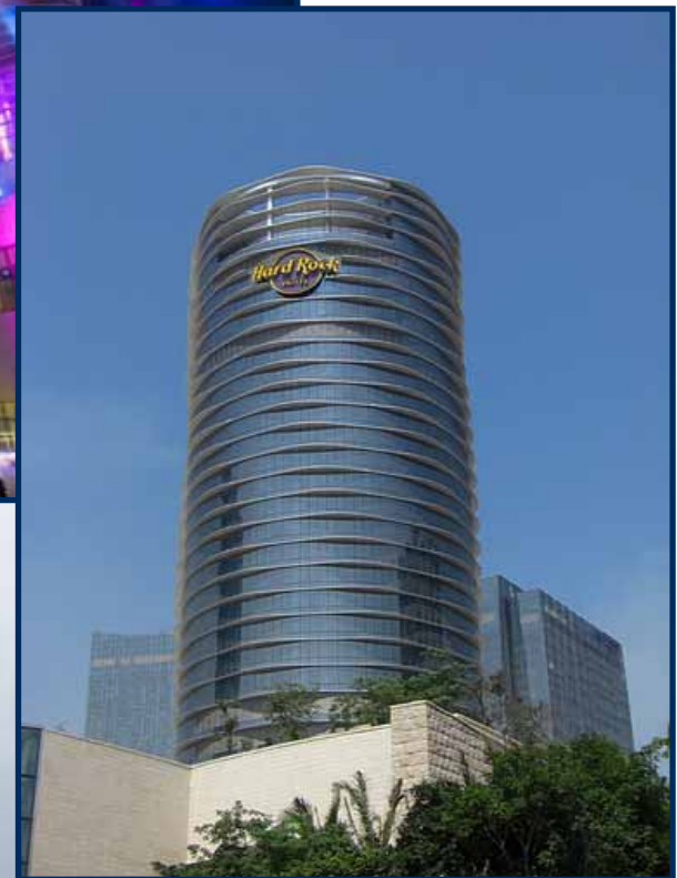
Hard Rock at City of Dreams