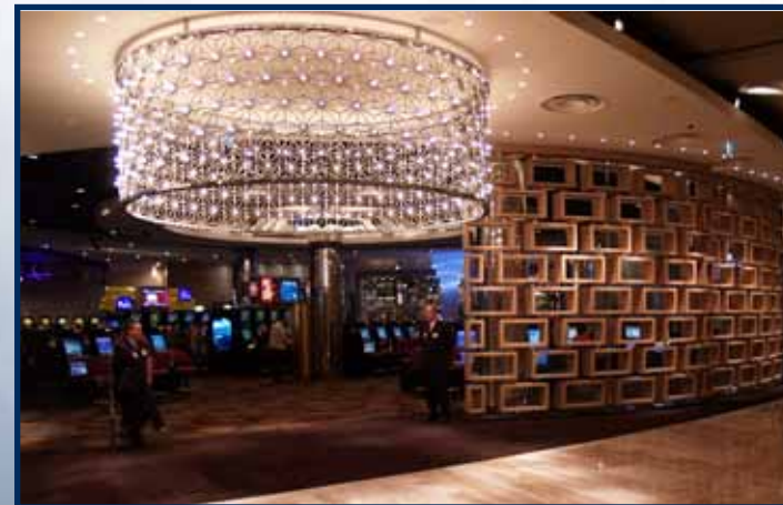
Western Gaming Precinct