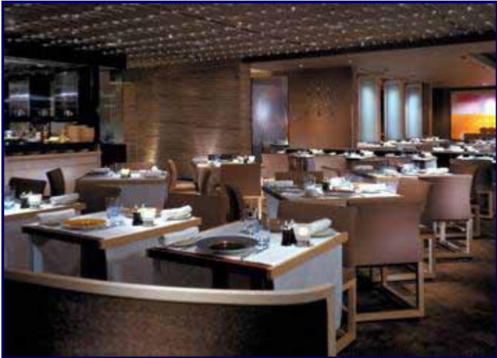
24 Hour Western & Asian Restaurants