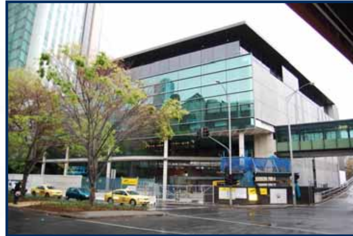
Crown Conference Centre under construction