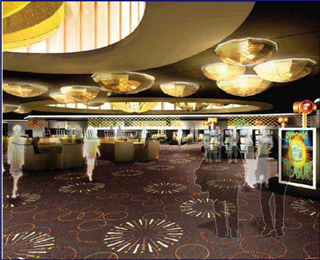
Central Casino Refurbishment