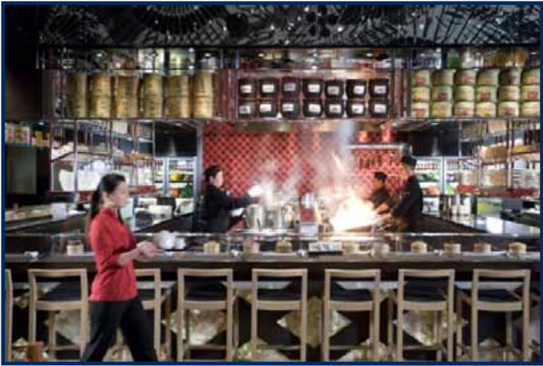
Sho Noodle Bar