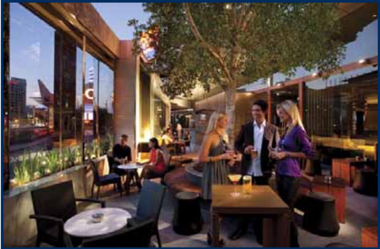
Lagerfeld Beer Garden