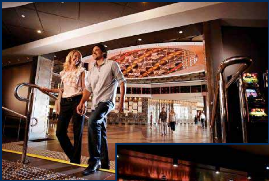
Casino Main Entry The Latest Stage of the Ongoing Casino Redevelopment