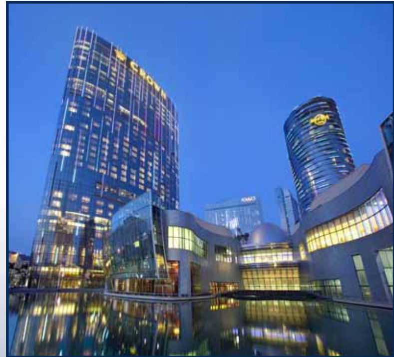
City of Dreams