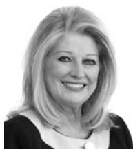
The Hon. Helen Coonan

This is our first Annual Review which, excitingly, represents the conclusion of our first full year of operations following the establishment of the Foundations by James Packer. We are now one year into our 10 year journey which will deliver $200 million of funding to the Australian community through our National Philanthropic Fund, a joint initiative of the Crown Resorts and Packer Family Foundations.