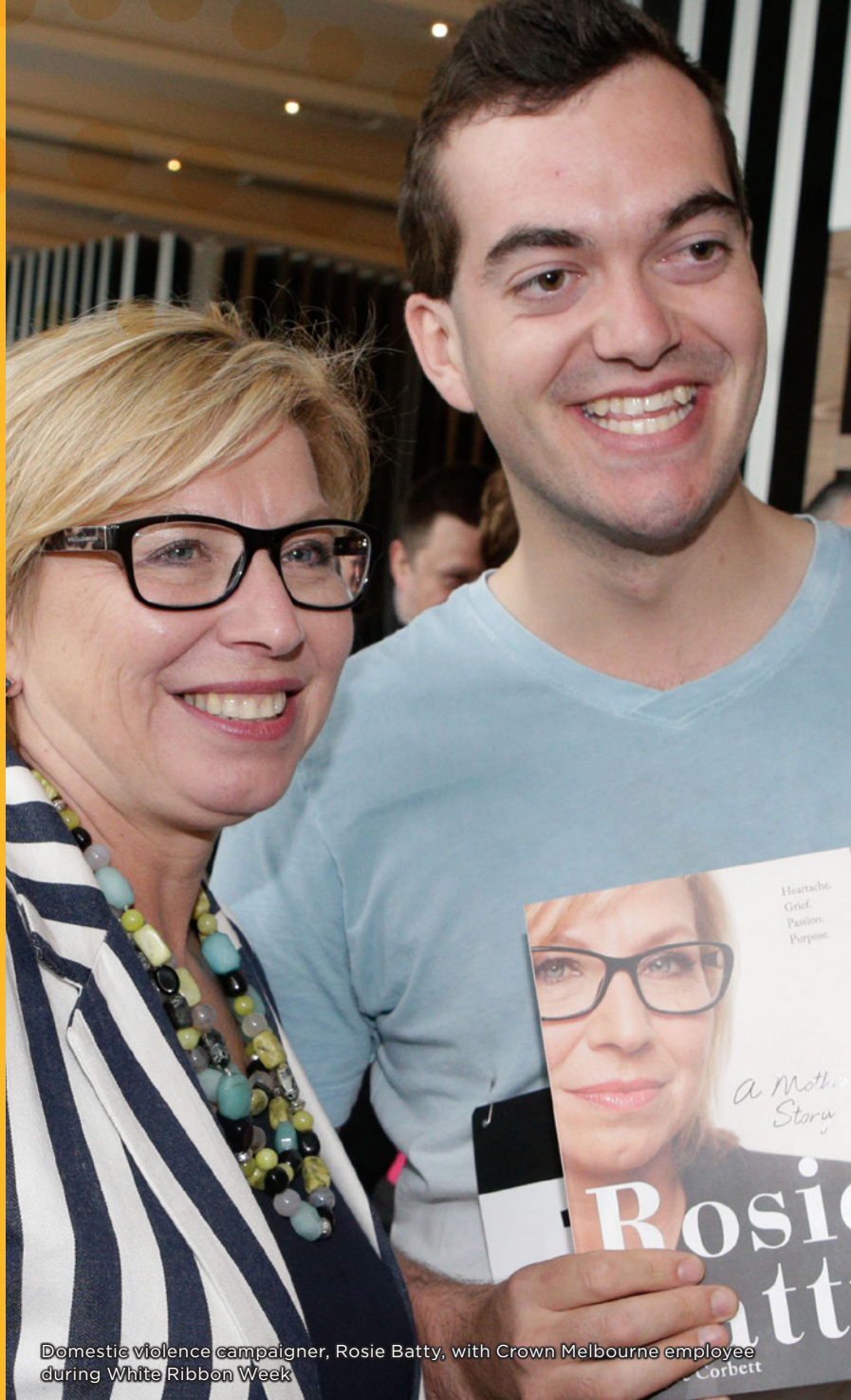
Domestic violence campaigner, Rosie Batty, with Crown Melbourne employee during White Ribbon Week