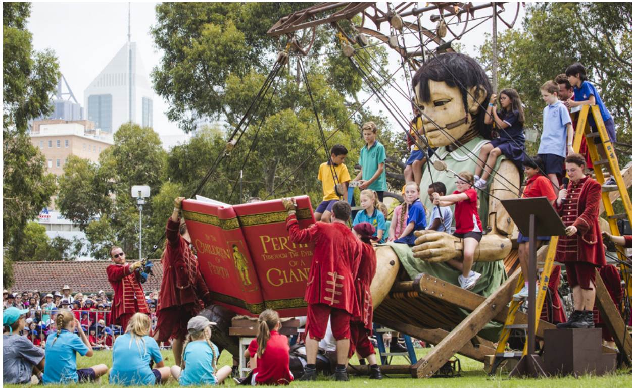
The Foundations were the presenting partners of The Giants which attracted over 1.4 million visitors to Perth.

To learn more about the Perth International Arts Festival, visit their website: https://perthfestival.com.au/