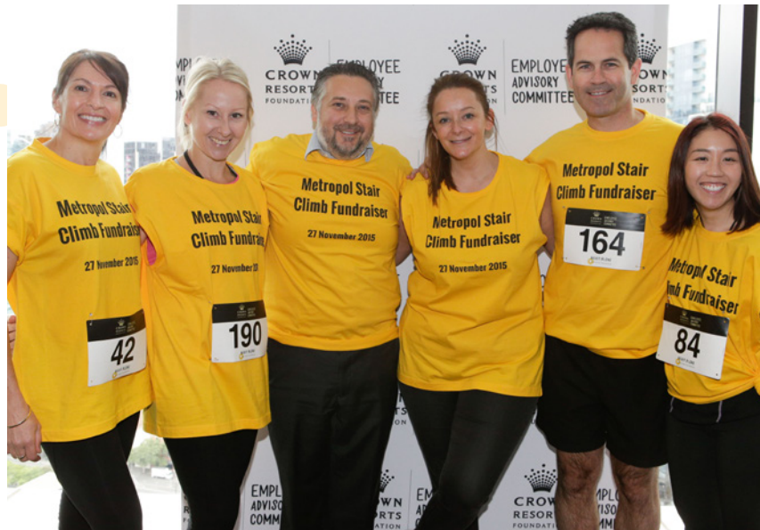
Members of Crown Melbourne's EAC

To learn more about The Luke Batty Foundation, visit their website: www.lukebattyfoundation.com.au/